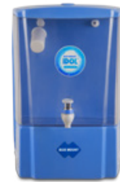
Product Code: BM41

Product Dimension: 12 (H) x 10.5 (W) x 16.7 (L) inch.