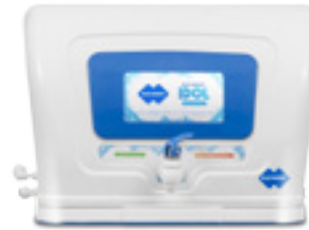
Product Code: BM40